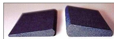
Curved Tool Sharpener ( Narrow )